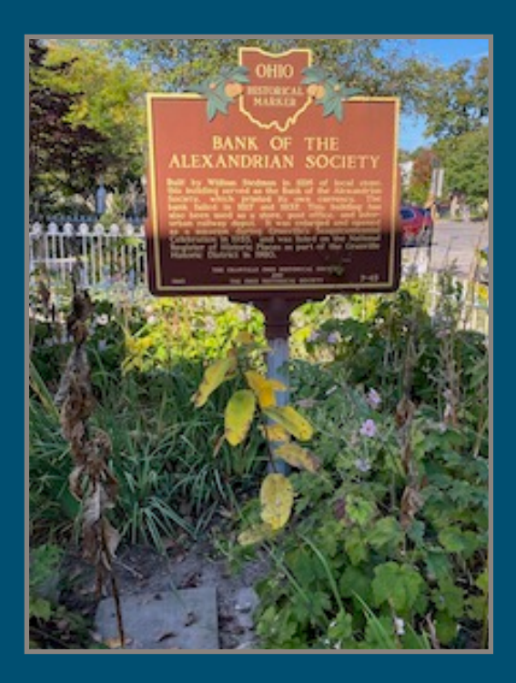
A garden is always a series of losses set against a few triumphs, like life itself. - May Sarton

Please use the enclosed card to make your gift to cultivating a rosy future.